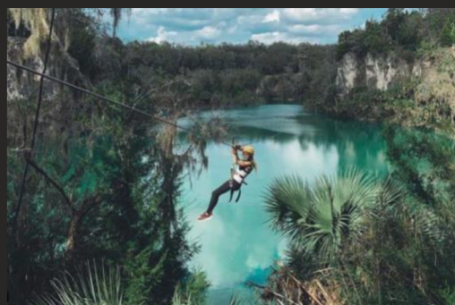
The Canyons Zip Line & Adventure Park